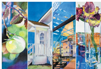
WATER AND FIRE